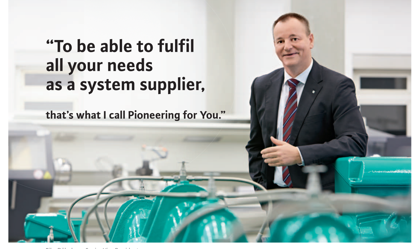
Division Submersible & High Flow Pumps, WILO SE Hof/Germany

"Pioneering for You" is our commitment to a clear customer focus, strict quality orientation and strong passion for technology. In times of dwindling natural resources, the responsible management of water is an extremely important task, which is why we are committed to providing pioneering developments, sustainable product solutions, and cooperative support to ensure you can rely on our solutions for the daily management of water. That's what we call Pioneering for You.